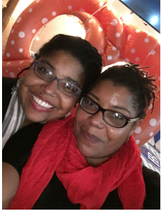
This is Raya and her sister. _____ are sisters. (Two answers!)