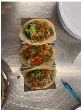
This is Raya's favorite food. _____ is her favorite food.